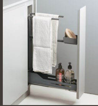
Towel rail extension, Libell (white, silver, anthracite)