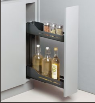
Base unit pull-out, Libell (white, silver, anthracite)