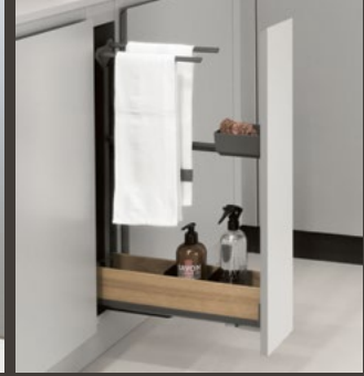
Towel rail extension, Fiore (anthracite)