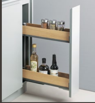
Base unit pull-out, Fiore (anthracite)