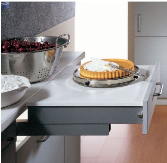
Same level as the worktop: Additional space!